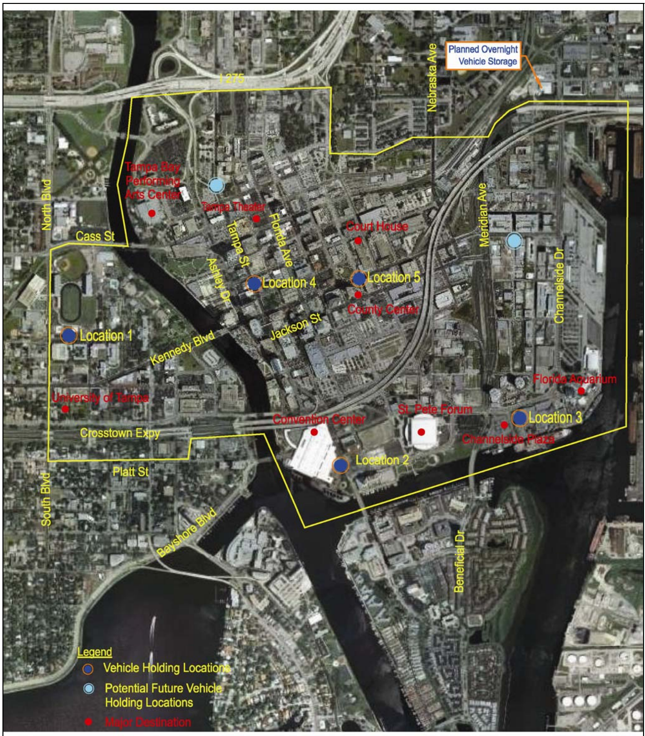
Figure 3 - Vehicle Holding Locations and Major Destinations